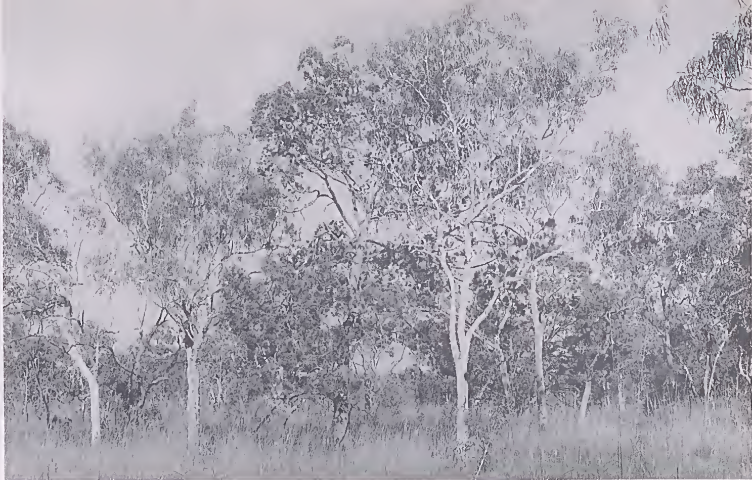
Figure 6. Eucalyptus latifolia - E. tetradonta association on lateritic podzolic, 3.5 km east of Cone Mountain.